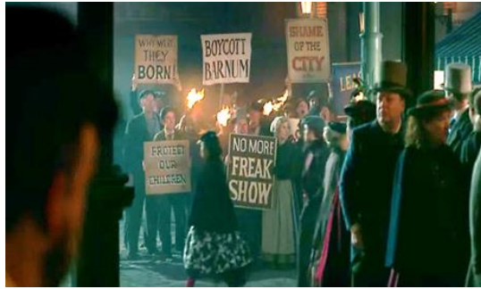
Picture2. The banners of demonstrators against Barnum's circus

4.3 The effect experienced by P.T. Barnum and his friends was doing seclusion and they overcame the discrimination by looking for recognition