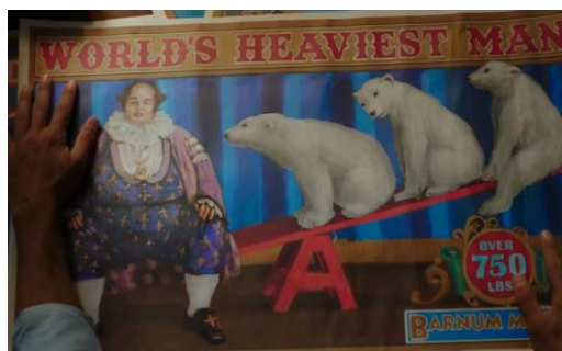
Picture1. Barnum exaggerating the weight from 500 to 750 lbs

Right after P.T. Barnum and the applicant's small talk, Barnum printed the promotional banner with the title written as 'World's heaviest man'. He also adds the additional information that said the weight was over 750 lbs on the right bottom corner of the promotional banner.