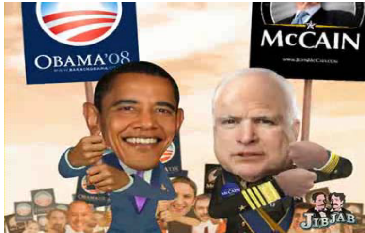
Youtube.com Times for Some Campaign Animated Caricature