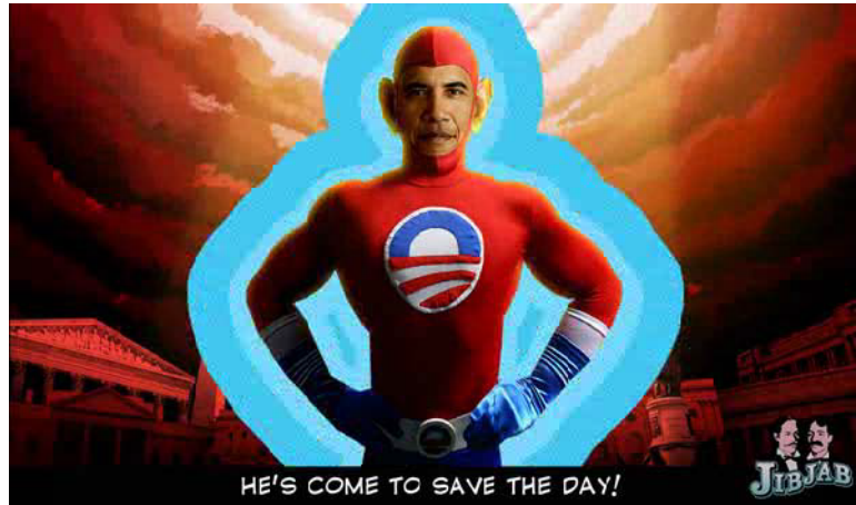
Youtube.com He_s Barack Obama Animated Caricature

HE'S COME TO SAVE THE DAY! He passed a major stimulus Then said he'd half the deficit HE HE! HA HA! Stop unemployment! Fix healthcare in his spare time! He's Barack Obama HE'S COME TO SAVE THE DAY! [Seeking / 00:00:33 – 00:00:50]